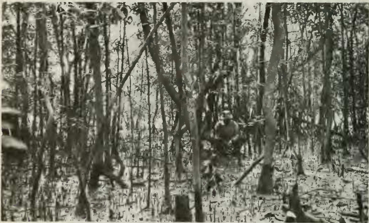
Fig. 8. General view of Avicennia officinalis forest in Sarawak

the chalaza putting forth numerous lateral branches and then into the placental column where the branches become much more extensive and ramify into the tissues. The endosperm proper grows out of the ovule carrying the embryo with it; thus a major part of the cellular endosperm and the embryo embedded in it come to lie in the locule, where their further development takes place. In older stages of development, the two cells of the micropylar haustorium develop plasmodesma-like connections. Similar connections are also established with the contiguous endosperm cells. The growth of the haustorial branches in the ovule and placental column is strictly intercellular."